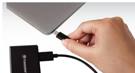
Type-C USB connector